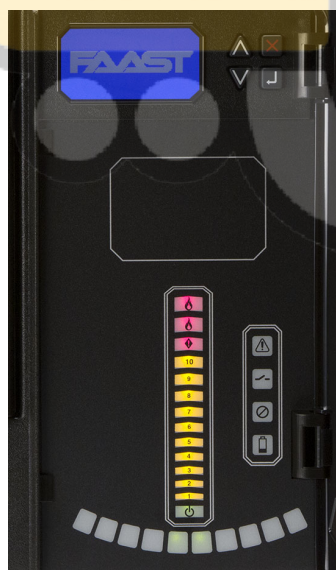
User Interface Display: Intelligent FAAST® XS