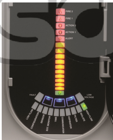
User Interface Display: Intelligent FAAST® XM